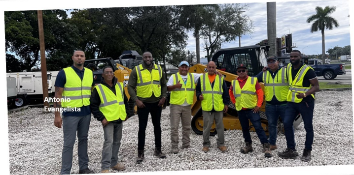
AEAK LLC team working on infrastructure projects in Florida