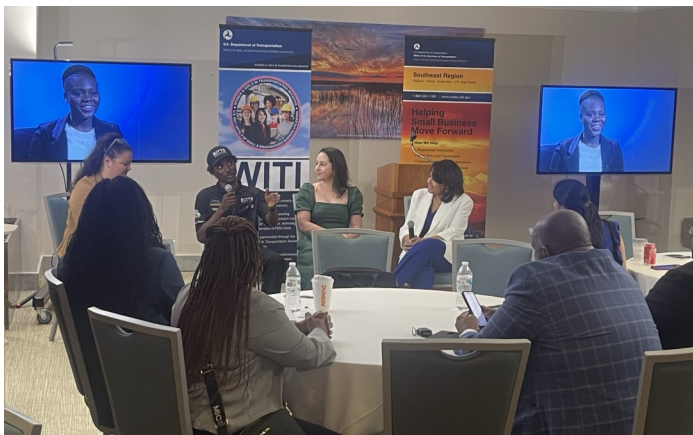
Left Photo: U.S. DOT OSDBU meets with small business firms to talk about women in transportation-related careers. Right Photo: Miami International Airport hangar during a WITI tour with local high school students.

The Southeast SBTRC works closely with the transportation contracting community and other technical assistance providers to offer no-cost technical assistance programs designed to enhance the capabilities of small and disadvantaged businesses in Alabama, Florida, Puerto Rico, and the Virgin Islands.